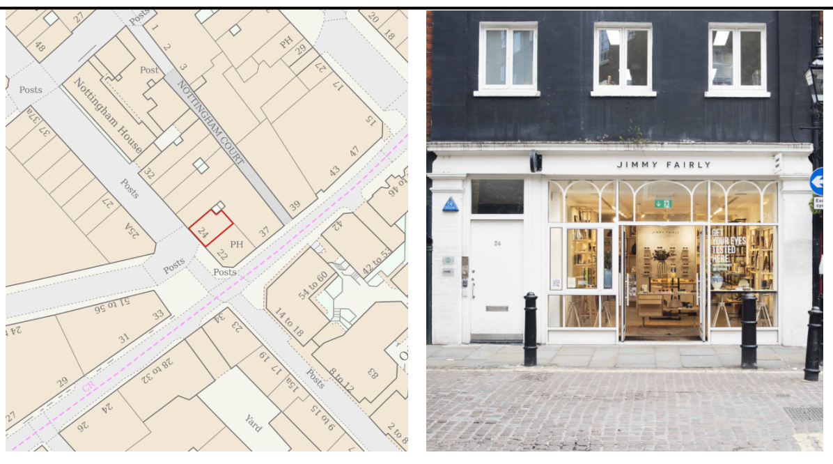
Images 1 & 2 – application site location & photograph of existing shopfront

The site is located within the Seven Dials (Covent Garden) Conservation Area. The conservation area covers an area that encompasses the streets around Seven Dials and others to the north-east. Its broader significance is derived from the evidence it provides of the seventeenth century urbanisation of the area following the establishment of Covent Garden Market.