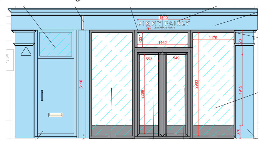
<u>Image 4</u> – <u>revised</u> proposals for ground floor shopfront (drawing extract)

1.4 Following concerns raised by a number of local amenity groups (see 'Consultation summary' section above), as well as, by the Council, the applicant amended the proposal and provided revised drawings as shown in Image 4 below: